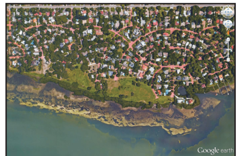
City-maintained park land just steps away meanders along Tampa Bay.