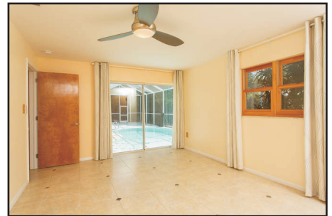
Two other spacious bedrooms and a hall bath are on the opposite side of the home.