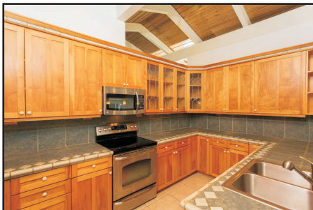
The kitchen features solid maple hand crafted cabinetry, designer lighting, and a dining bar open to the great room.

If you appreciate distinctive design, see this house for yourself today!