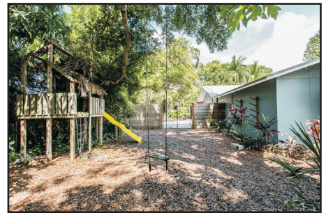
You'll enjoy the outside - a wide lanai and screened pool plus two side yards.