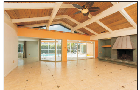
The great room has vaulted ceilings and a spectacular fireplace. There's also a spacious family room (below).