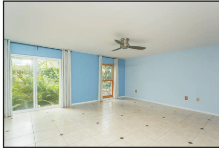
The large Master suite has an artistic bath and opens to a private side terrace.