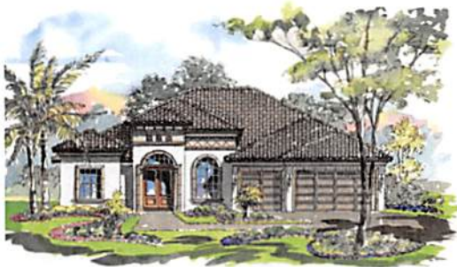
Mediterranean, Elevation "C"

3 BEDROOMS / 3 BATHS / DEN / BONUS ROOM GREAT ROOM