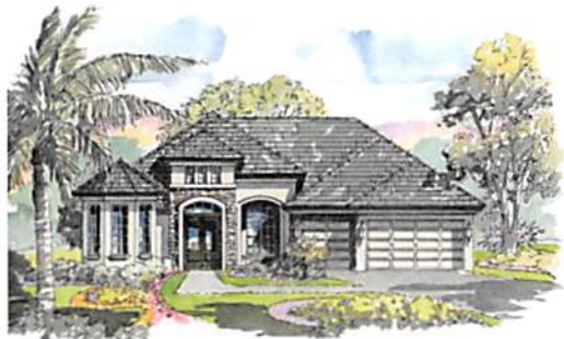
French Country, Elevation "M"