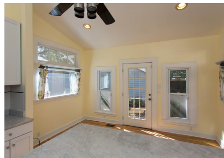
The sunroom (above left) and breakfast room are bright, inviting spaces.