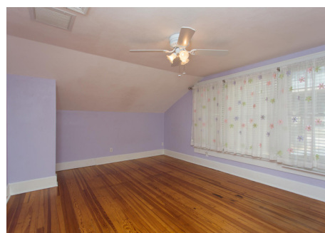
Upstairs are two more bedrooms, a full bath and laundry room.