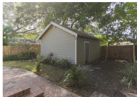
In the back yard, there's a lovely brick patio and a detached garage.

See more photos and information at: www.OldNortheastHomeForSale.com