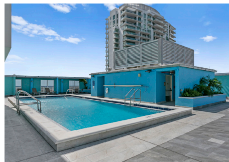
You'll love all of the building's amenities!