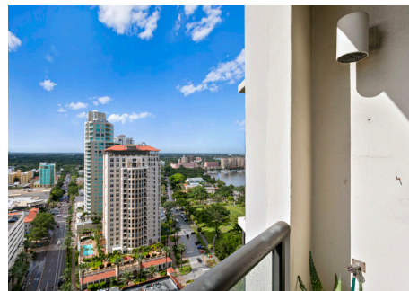
The balcony has great views in several directions!