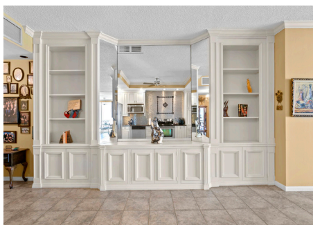
There are lots of built-in features and still space for your artwork.