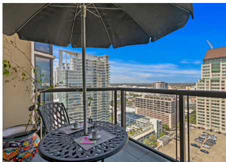
The balcony faces west - great sunset views!