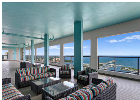
You'll love all of the building's amenities!