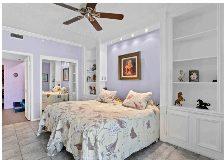
The primary bedroom has a private bath with a dressing area.