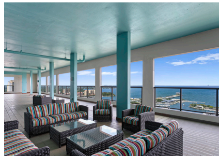
You'll love all of the building's amenities!