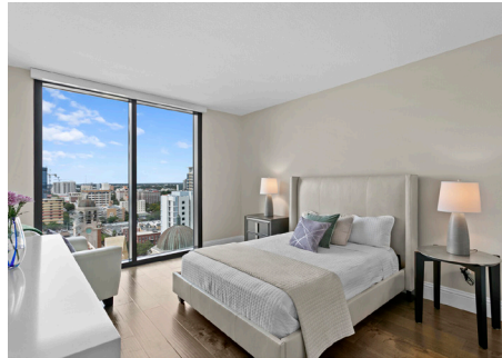
The second bedroom also has a private bath.