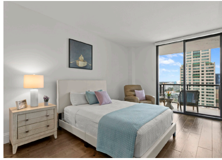
The primary bedroom has a private bath and two separate closets.