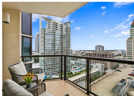
The balcony offers views in multiple directions.