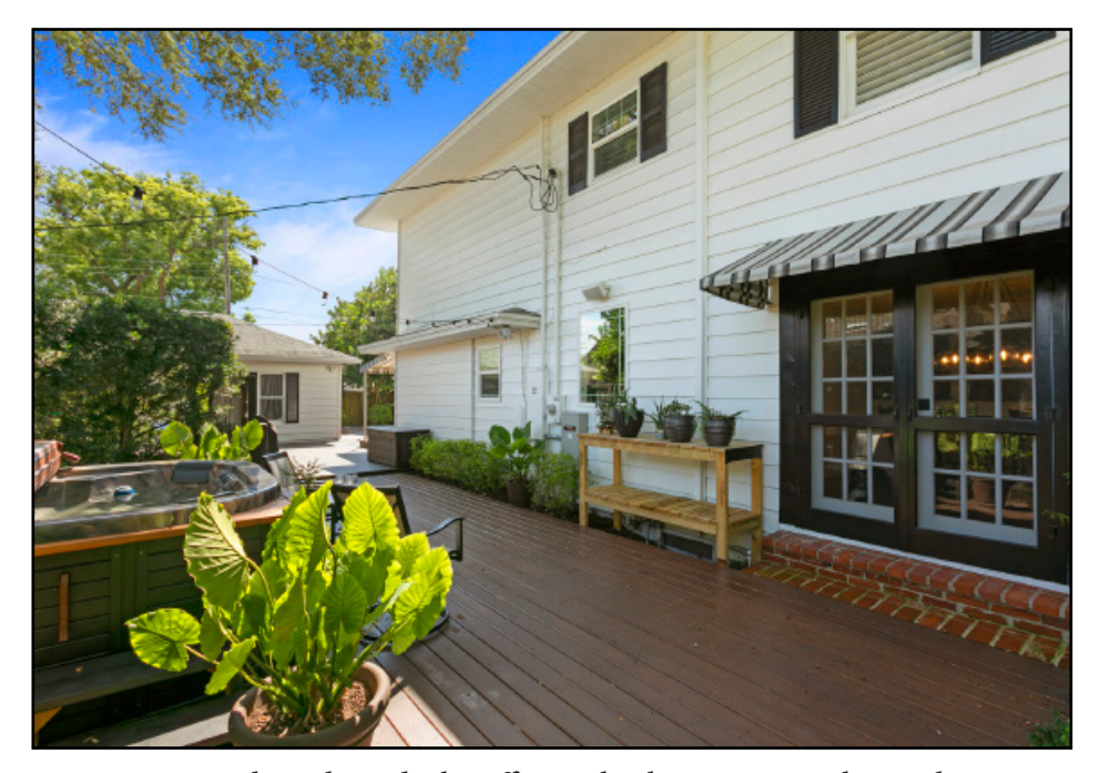
Wrap-around outdoor decks offer multiple spaces to relax and enjoy.