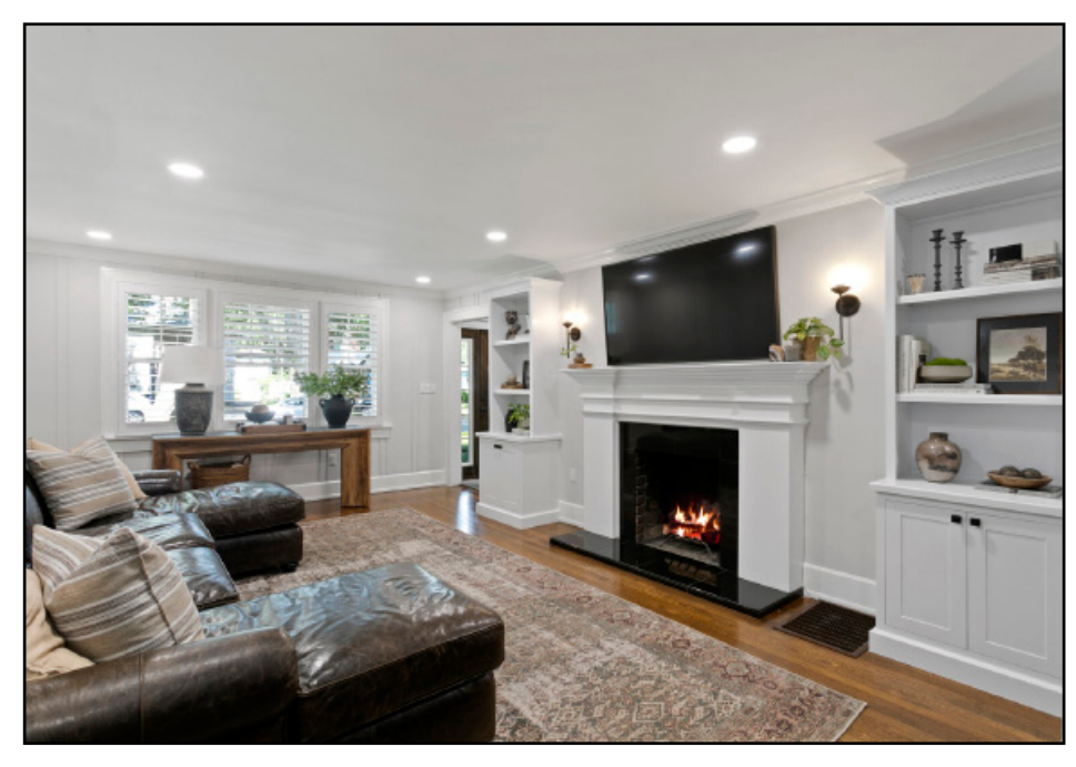
Formal living and dining spaces capture the historic charm of the home.