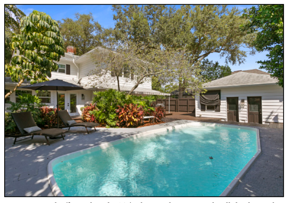
Want to cool off on a hot day? The large saltwater pool will do the trick.