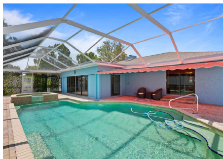
The birdcage screened pool and spa offer fantastic outdoor living!