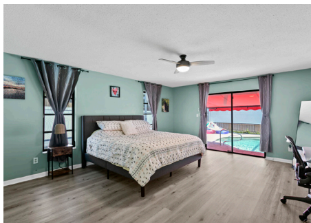
The primary bedroom is spacious and bright, with an en suite bath.