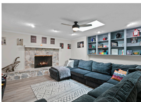
There's a huge media / family room that you'll absolutely love!