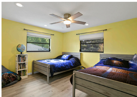
The other two bedrooms are on the opposite side with a shared hall bath.