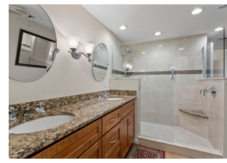
The primary bedroom opens to the balcony and has a private bath.