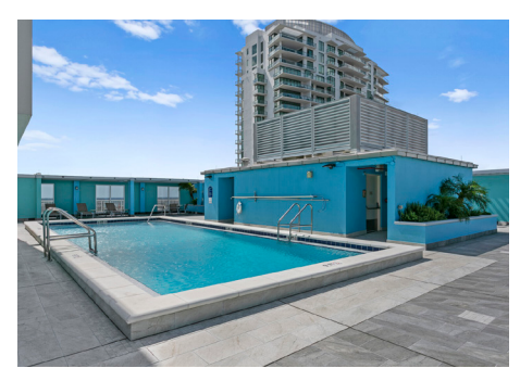
You'll love all of the building's amenities!