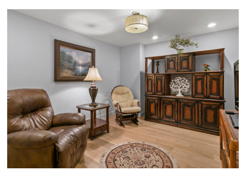
In addition to a den/office, there's a clever built-in desk.