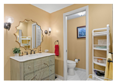
The second bedroom has a murphy bed, and an adjacent full bath.