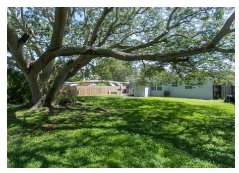
The huge back yard with its lovely shade tree is breathtaking!