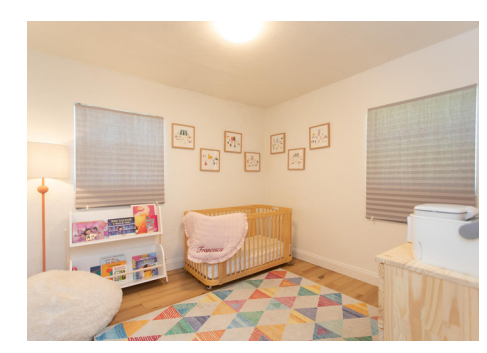
Both bedrooms are good sized, with custom closet organizers.