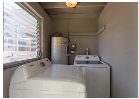
Outside, there's a nice patio, and the laundry room is around the corner.