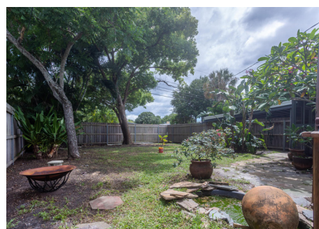
There's plenty of space to enjoy outside, and even a hot tub!