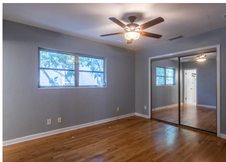
The primary bedroom has an elegant remodeled private bath.