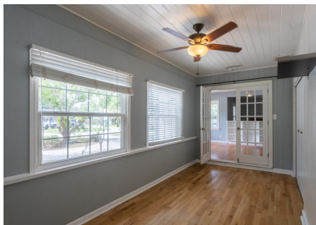
The front bedroom would make an ideal office; the 3rd opens to the patio.