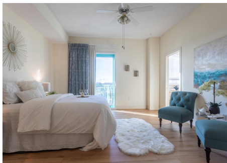
The owner's suite has a private bath and walk-in closet.