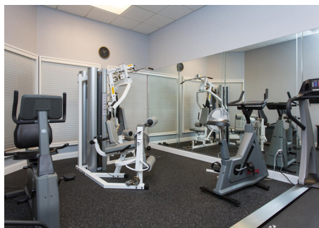
Amenities on the 3rd floor include fitness center and swimming pool.