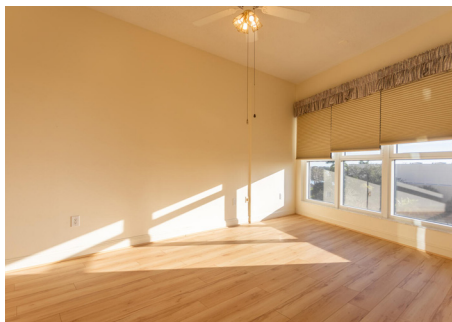
There's a second bedroom and full bath for guests.