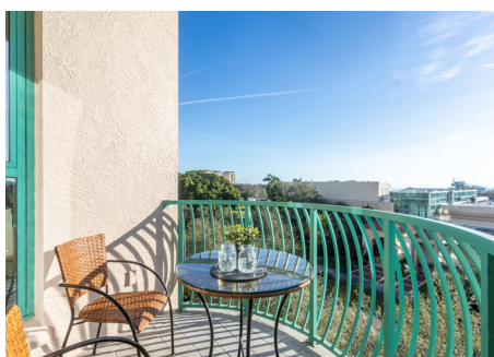
Enjoy the park and Beach Drive views from the balcony.