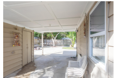
There's tons of patio space, and the carport doubles as a covered area.