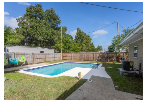
The pool is quite large - all your friends will want to come over to swim!