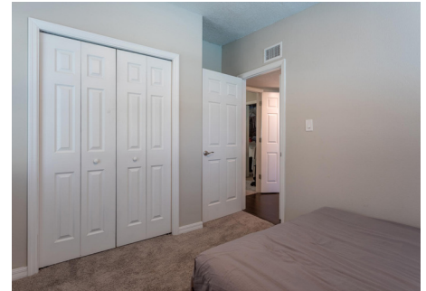
The remodeled bath, hall laundry closet and second bedroom.