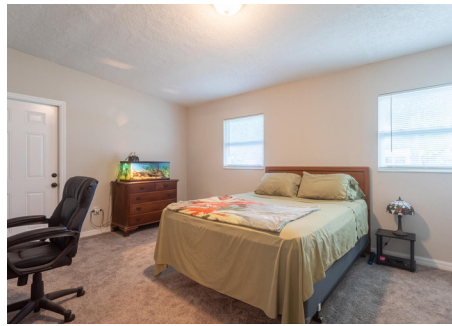
The primary bedroom is huge, with tons of closet space.