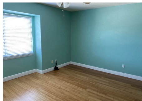
The Master suite and a third bedroom are on the upper level.