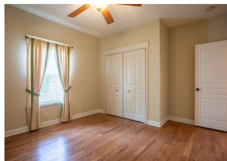
Two other bedrooms share a full hall bath.