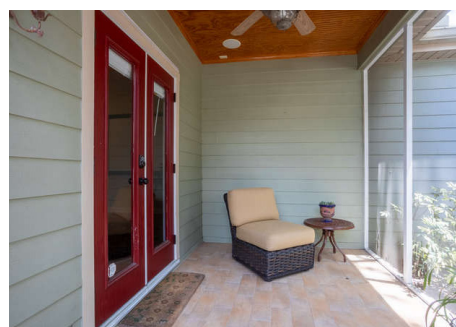
There's a den/media room that opens to a small screened porch.