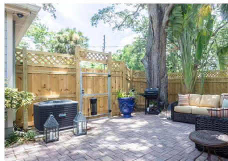
The rear patio area is nicely landscaped, and there's alley access.

See more photos and information at: www.WoodlawnBungalow.com