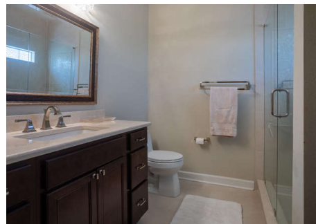
The Master suite has a private bath and walk-in closet with organizers.