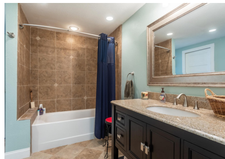
The other bedroom and en suite are on the opposite side of the home.