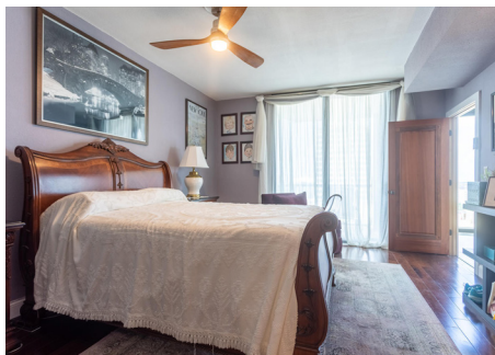
The Master suite has a private bath and walk-in closet with organizers.