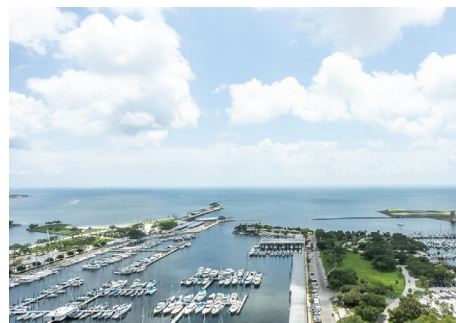
Amenities on the 28th and 29th floor include stunning eastern views.

See more photos and information at: www.BayfrontTowerCondo.com