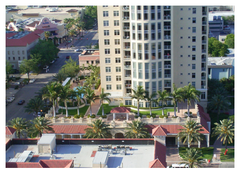
Florencia offers elegant common areas and a third floor amenity deck.