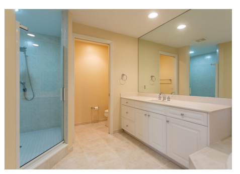
The Master suite opens to the east balcony and features a private bath.