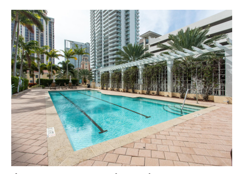
Amenities include a pool & spa, fitness center and much more.