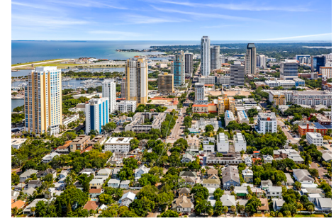
You'll love the proximity to downtown and the waterfront parks.

See more photos and information at: www.FloriDeLeon.com