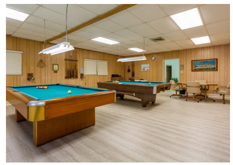
Enjoy the fishing dock or billiards room, and there's also a fitness room.

See more photos and information at: www.ShoreTowersCondo.com