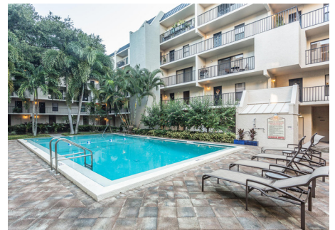
Mature oak trees and landscaping surround the courtyard & heated pool.