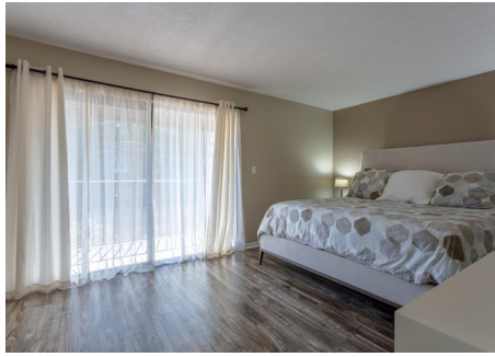
The Master bedroom opens to a wide east-facing balcony.