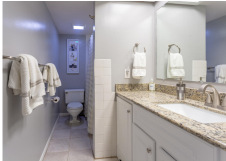
A bath updated with granite counter top is between the two bedrooms.