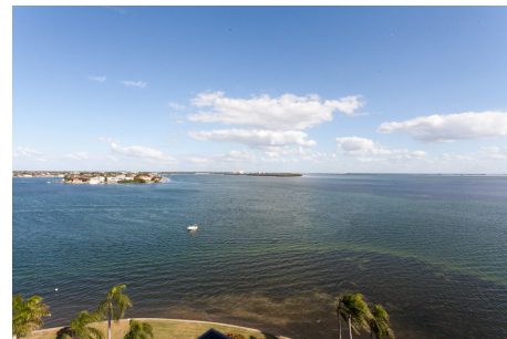
Enjoy spectacular water views from the unit and the balcony.