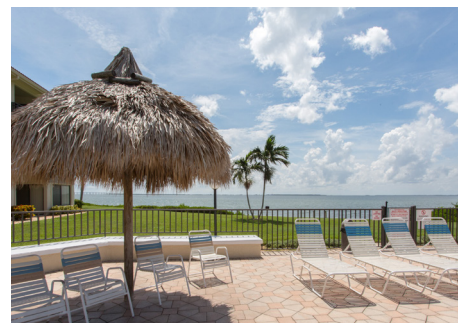
The campus is like a resort, with pool & spa, and waterside walkways.

See more photos and information at: www.PalmaDelMarCondo.com