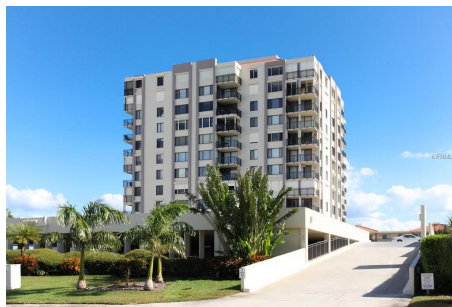
This Palma del Mar condo offers a piece of paradise.