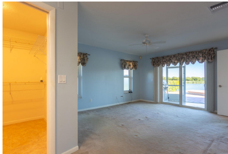
There's a private Master suite with walk-in closet and remodeled bath.