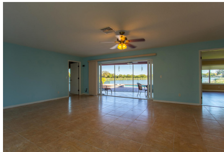
The living/dining room opens with pocketing sliders to the lanai.