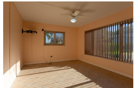
There are two spacious bedrooms on the opposite side of the home.