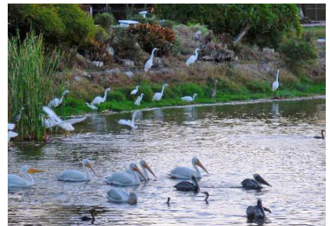
From sunrise to sunset you'll enjoy the peaceful lake view.