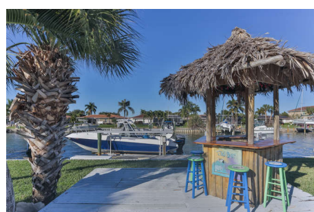
There's a pool, hot tub and tiki bar for your outdoor enjoyment!