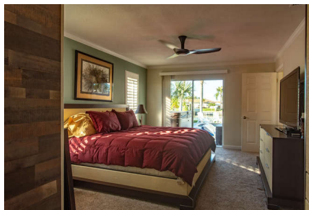
The Master suite has a walk-in closet and a private bath with shower.