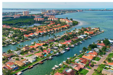
This is great boating water, with a dock, boat lift and new seawall.

See more photos, drone video and information at: