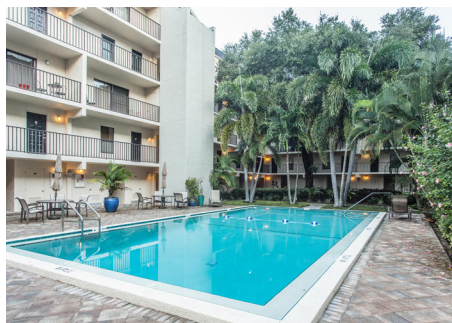
Mature oak trees and landscaping surround the courtyard & heated pool.