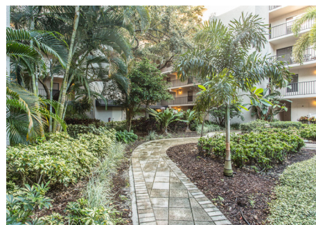
Townview is a hidden gem just two blocks from Beach Drive.