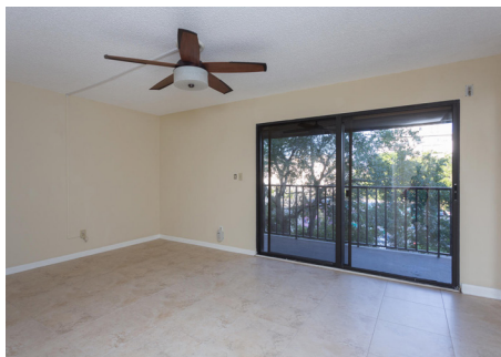
There's a large Master bedroom with a balcony facing north.