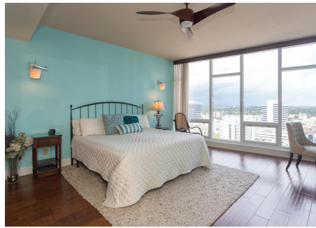
The Master suite features a large walk-in closet and a private bath.