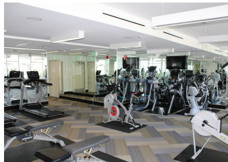
The amenities include a heated pool & spa, fitness center and much more.