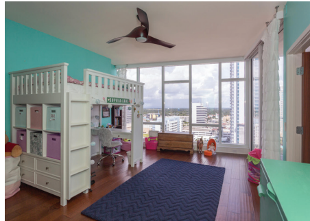
The second bedroom suite has a private balcony.