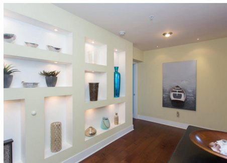
Decorator details and a spectacular view are hallmarks of this unit.