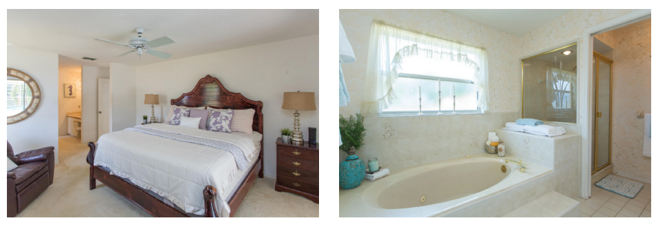
There's a private Master suite, as well as three other bedrooms.