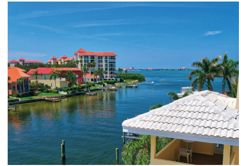
Enjoy the screened pool, or head up to the lookout tower for great views.

See more photos and information at: www.BroadwaterHome.com