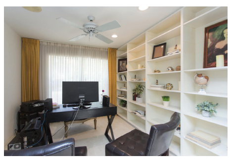
Relax in the bright family room, or retreat to the quiet office.