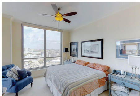
The Master suite has a walk-in closet and a private bath.