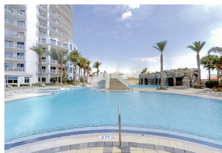
There are lots of spaces to enjoy throughout the lobby and amenity deck.