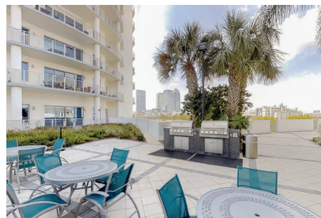
Imagine how much fun you'll have living here!