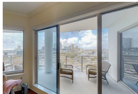
Both of the bedrooms open out to the wide balcony.