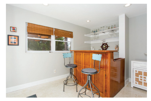
Of the other three bedrooms, one is currently used as a bar/cabana room!