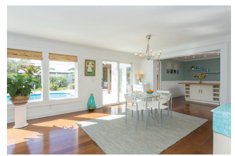
There's so much flexible space in this bright, welcoming home.