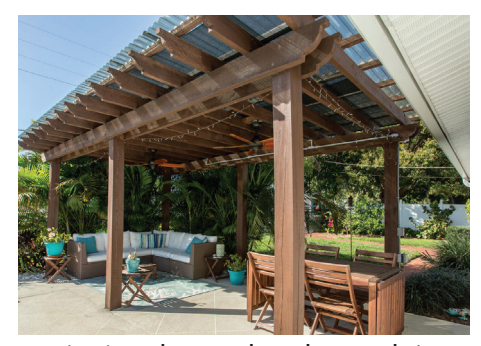
Imagine how much fun you'll have enjoying the pool and pergola!