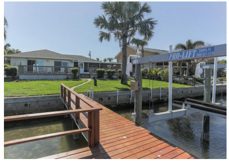
The dock has been rebuilt and new wrapped pilings installed.

See more photos and information at: www.CoquinaKeyHome.com