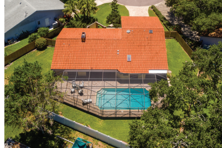
The pie-shaped lot allows for yard space outside the pool enclosure.