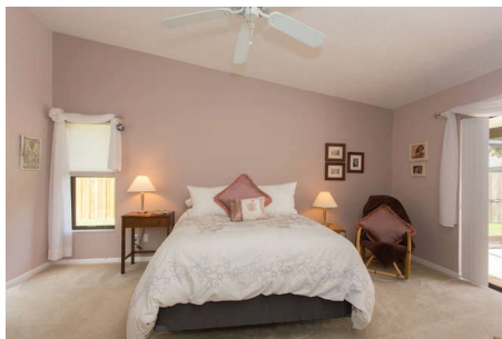
The large Master suite has an absolutely fantastic private bath.