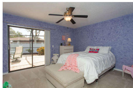
Two additional bedrooms are on the opposite side of the home.