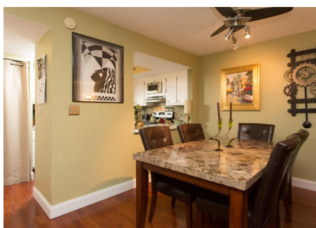
The flow is great for entertaining, and there's a powder room for guests.