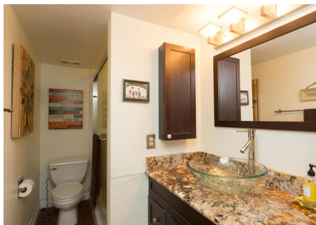
A nicely updated bath with shower is between the two bedrooms.