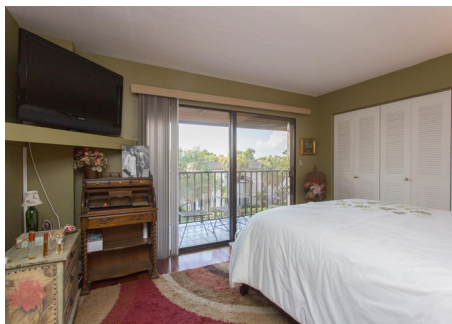
The Master bedroom opens to a wide north-facing balcony.