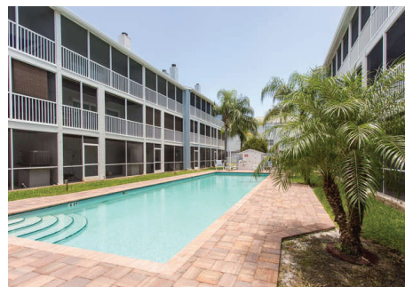
A spiral stair from your balcony makes getting to the pool easy!