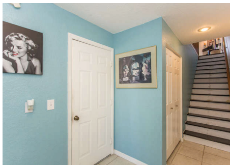
There's an entry foyer with access from the garage on the ground level.